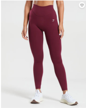
★ 4 Sweat Seamless Leggings Body Fit Plum Pink $60