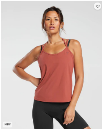
NEW Elevate Strappy Tank Regular Fit Rust Red $38