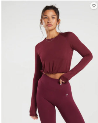
★ 4.2 Sweat Seamless Long Sleeve Crop Top Regular Fit Plum Pink $46