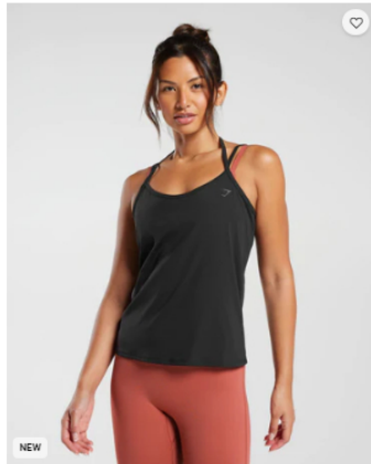
NEW Elevate Strappy Tank Regular Fit Black $38