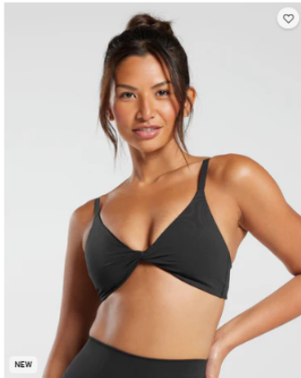
NEW Elevate Twist Front Bralette Light Support Black $40