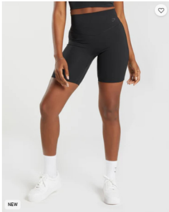
NEW ★ 4.6 Elevate Cycling Shorts Body Fit Black $48