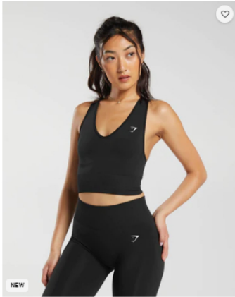
NEW ★ 3.9 Everyday Seamless Crop Tank Body Fit Black $24