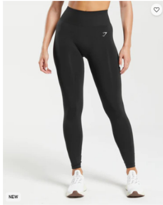
NEW ★ 3.2 Everyday Seamless Leggings Body Fit Black $38