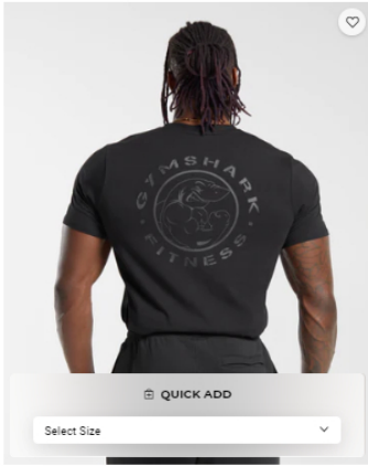
★ 5 Legacy T-Shirt Slim Fit Black $26