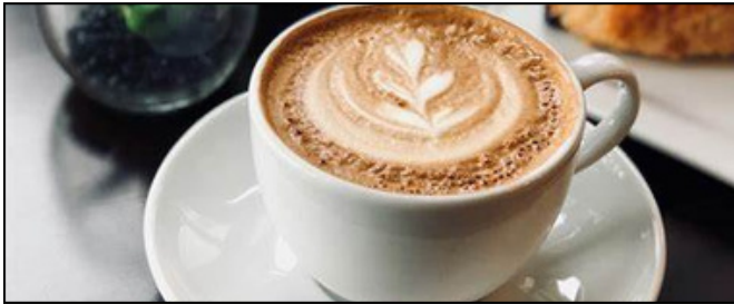
The Caffeine Website Payment Intergration Project