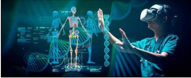
AI Voice Doctor Project