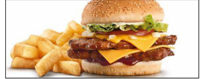
Burger Center Website Launch