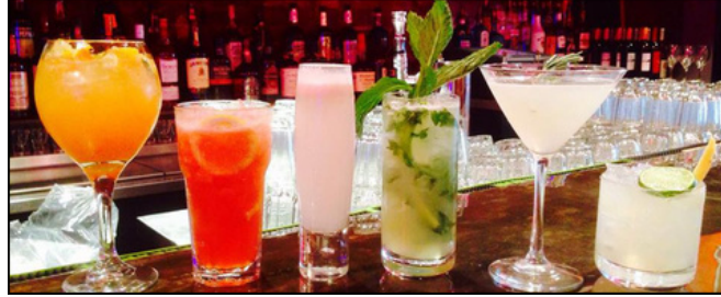
Drinking Game Cafe Project