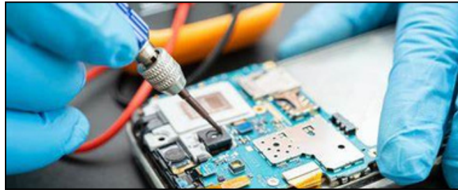
Phone Repair Website AI intergration Project