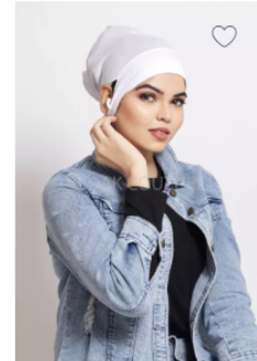
White Ear-slit Access Hijab Cap ₹330