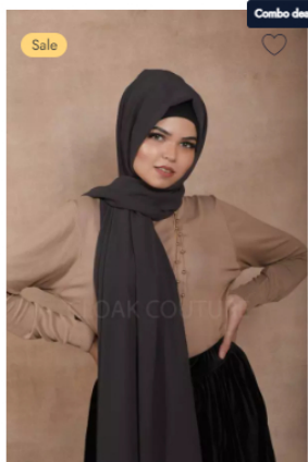
Dynamite Premium Chiffon Hijab ₹399 ₹375

More Comfort. More Class. More Style — all in one! Now shop combos on our premium chiffon hijabs and crinkled cotton hijabs on Eid-al-Adha mega sale.