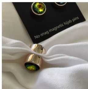
Light Gold Rimmed Emerald No-Snag Magnetic Hijab Pin ( 1 pair ) ₹299 ₹199