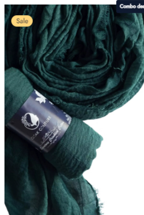
Timeless Teal Crinkled Cotton Hijab ₹299 ₹229