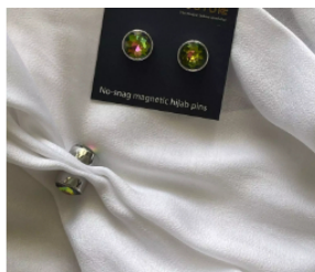
Silver Rimmed Emerald No-Snag Magnetic Hijab Pin ( 1 pair ) ₹299 ₹199