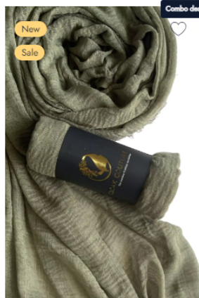
Sage Crinkled Cotton Hijab ₹299 ₹229