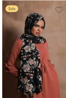
Onyx Chiffon Printed Hijab ₹499 ₹359