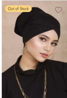
Black Criss Cross Tube Hijab Cap ₹299

Cult-faves that never seem to grow old. Shop from our best-selling hijabs to complete your wardrobe.