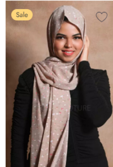
Serena Chiffon Printed Hijab ₹499 ₹359