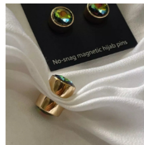
Gold Rimmed Emerald No-Snag Magnetic Hijab Pin ( 1 pair ) ₹299 ₹199