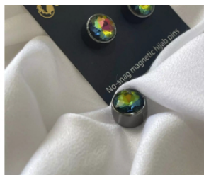
Platinum Rimmed No-Snag Magnetic Hijab Pin ( 1 pair ) ₹299 ₹199