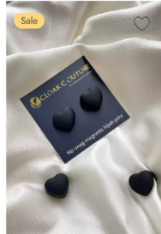
Matte Black Heart Shaped No-Snag Magnetic Hijab Pin (Set of 2) ₹399 ₹299